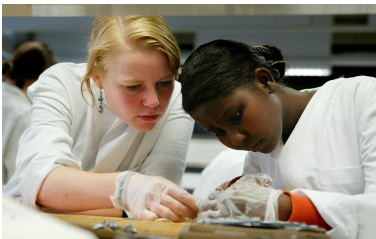
Shortages are likely to remain in sectors such as health care, primary and secondary education, horticulture and in the manufacturing sector.

The Dutch Refugee Council (Vluchtelingenwerk Nederland) gives practical support to refugees during their